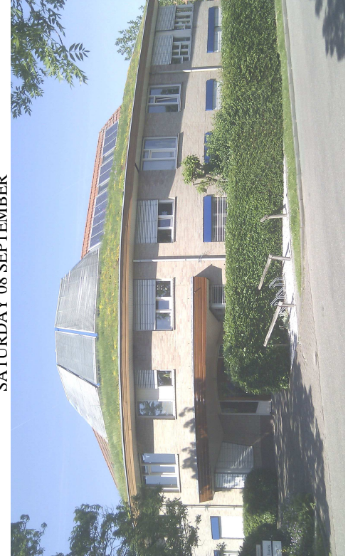
ECOLOGICAL BUILDING REGULIERING 12, BUNNIK, THE NETHERLANDS

ADVANCED CLINICAL NUTRITION 2012 Nutrients for prevention and cure of disease SATURDAY 08 SEPTEMBER